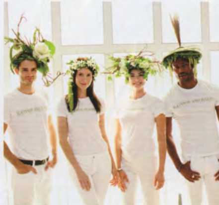
Models wearing beautiful headpieces in the McKinnon and Harris showroom