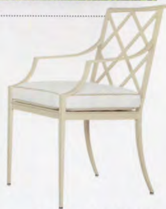
OTEY DINING SIDE CHAIR In Wicomico White. To the trade: mckinnonharris.com