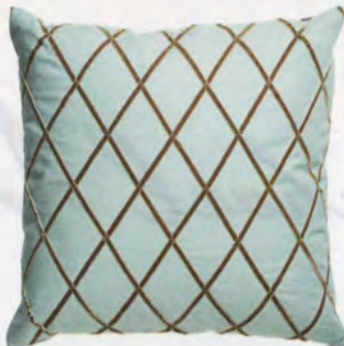
VELVET RIBBON DIAMOND PILLOW In Ice/Taupe. $363. dransfieldandross.biz