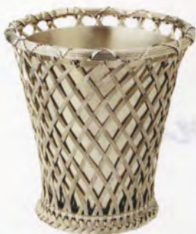
SILVER WIRE CACHEPOT By Bunny Williams. $59. ballarddesigns.com

A piece of furniture or even a single accessory is all you need to give a space a splash of treillage.