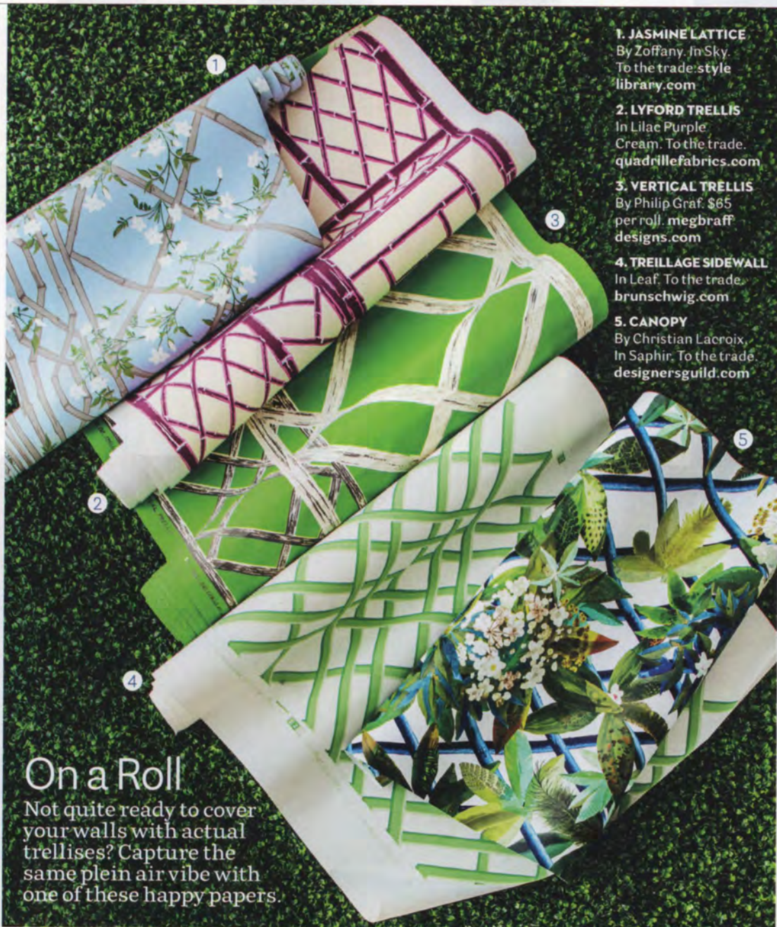
1. JASMINE LATTICE By Zoffany. In Sky. To the trade: stylelibrary.com