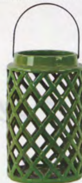
CERAMIC LANTERN By Urban Trends. In Green. $83. wayfair.com