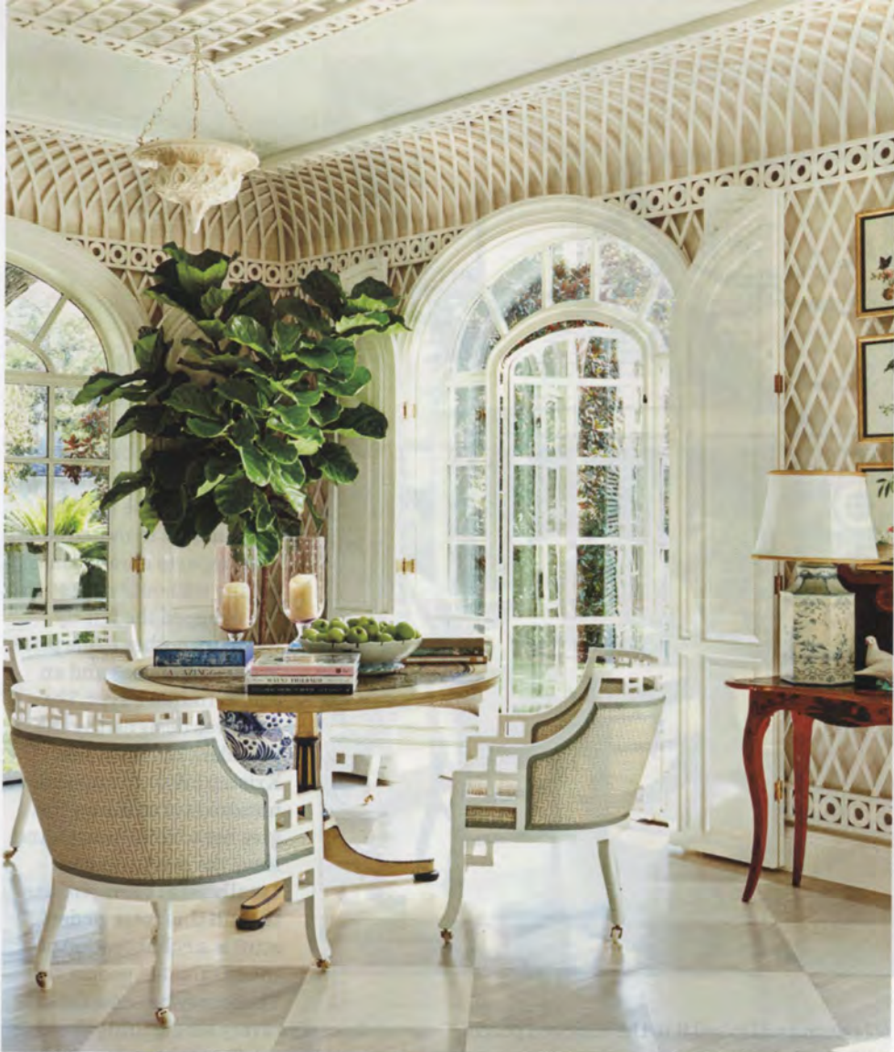
LEFT: Placed near the doors to the garden, a John Rosselli table and DeAngelis chairs in Veere Grenney's Temple upholstery provide a breezy setting for lunch. At night, a Moroccan-style light fixture throws sparkle onto the ceiling. BELOW: A pair of porcelain egrets perch on a palm wall bracket.